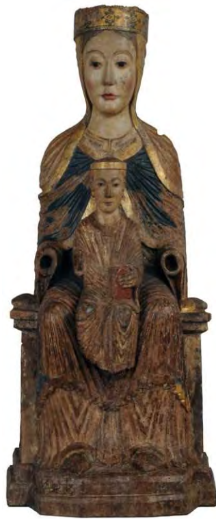
Fig. 10 – Virgin from Puenteadura (Castile), second half of the 12 th century, polychromed wood. 108 x 46 x 32 cm, Museu Frederic Marès, MFM 1408, Museu Frederic Marès © Foto: Guillem F-H (permission for reproduction obtained by the autor 06/11/2018).

the arrival of a foreign sculptor or artist. One of the most notable examples is the Virgin of Puenteadura (Burgos), studied by Ara Gil and Martínez, which is thought to have a probable French origin 47 (fig. 10). Indeed, it has been said that the repetitive and refined treatment of the creases in the clothing recalls those in sculptures from the Île-de-France, and more specifically from the Portail Royal in Chartres Cathedral, something that would enable us to justify production in a workshop in that region. In the context of Portugal the hypothesis has been considered of a foreign origin for the Christ of Bouças (Matosinhos), given the similarities with examples from Burgundy and from elsewhere in the Iberian Peninsula, such as Palencia, Aragon and Catalonia 48 .