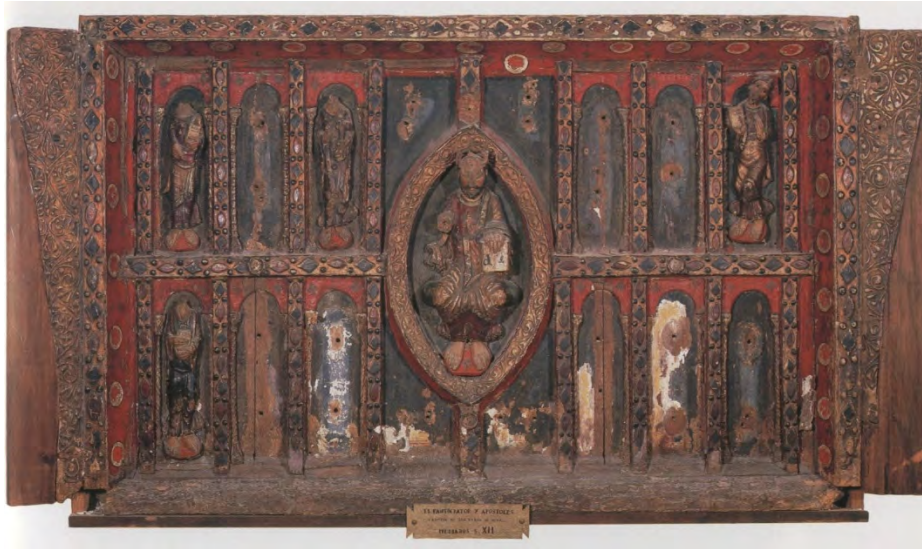
Fig. 7 – Altar frontal from Sant Pere de Ripoll (Catalonia), second third of the 12 th century, polychromed wood, 101 x 186 x 23 cm, Museu Episcopal de Vic, MEV (© Museu Episcopal de Vic) (permission for reproduction obtained by the autor 30/04/2019).

Girona) 38 , the rough imitation of the carving's features with respect to the Maiestas Domini on the doorway in Ripoll is combined with a more accomplished reproduction of geometrical and floral motifs on painted frontals originating from the same workshop, like the one from Sant Martí de Puigbò 39 .