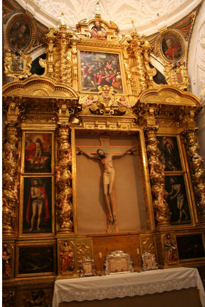
Fig. 1 – Crucifix of Alquézar (Aragon), second half of the 12 th century, polychromed wood, Colegiata de Santa María de Alquézar.

scarcity of records to supply us with evidence for dating and classification. We have very little information regarding their dating, authorship and patronage, although there are some significant points of reference.