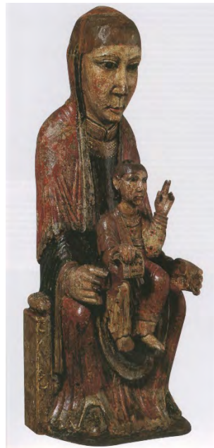
Fig. 11 – Virgin from Ger (Catalonia), ca. 1180, polychromed wood, 52,5 x 20,5 x 14,5 cm, Museu Nacional d’Art de Catalunya, MNAC 65550.

If we turn to the Catalan context, we may suspect a similar phenomenon in the case of a group of images of the Virgin that emerged around the bishopric of La Seu d’Urgell towards the last quarter of the twelfth century, which corresponds to the same stylistic and partly iconographical conception. Lately, some authors such as Tim Heilbronner have interpreted these images as the symbol of Mary as a priestess, to judge by her clothing 49 . Of the ones conserved, the most outstanding piece in the group is the Virgin of Ger (Museu Nacional d’Art de Catalunya) 50 (fig. 11), which presents considerable stylistic similarities with the image of the Angel from a Visitatio Sepulchri from Cologne 51 . If we accept a direct link between the Catalan Virgin and the angel from Cologne, we have to consider how it came about.