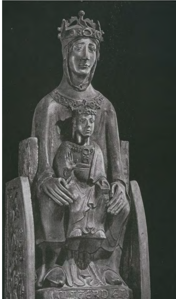
Fig. 12 – Vierge de la Victoire (Roussillon), ca. 1200, lead mixed with tin (with traces of gilding) and wood core, 54 cm, in Sainte-Marie de la Victoire Church, Thuir (Roussillon).