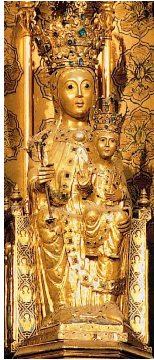
Fig. 3 – Virgen de la Vega , Salamanca, ca. 1200, Gilt-copper alloy, champlevé enamel, and cabochons and wood core, 72 cm, Old Cathedral, Salamanca (permission for reproduction obtained by the autor 02/11/2018).