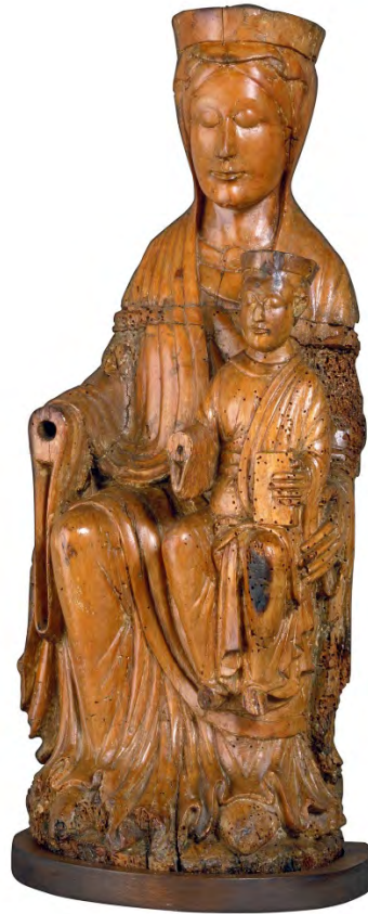
Fig. 5 – Virgin . Unknown provenance, ca. 1230, wood carving with traces of polychromy in tempera, 79 x 33,5 x 29 cm (Museu Nacional d'Art de Catalunya, MNAC 003924).

With regard to the images of Christ on the Cross it is important for example to refer to the Crucifix from Santa Clara de Astudillo (near Palencia), dated to the second half of the twelfth century, which belongs to one of the most frequent types in the groups of Christ on the Cross, dressed in the perizonium . With different variations, we observe similar cases in Italy, France, and elsewhere. Examples of this type are conserved from Galicia to Catalonia, always showing different variations with respect to the clothing, the attributes, the position of the arms or the head and, needless to say, the style. The original cross has very often not survived. In fact, in Catalonia it presents us with a choice apparently halfway between the Majesties and the numerous cases of Christus Patiens . To go back to the carving from Astudillo, it is an expression of the dual nature of Christ (divine, human), marked by a solemn expression, the head richly crowned, with his eyes open. From a stylistic point of view, associations have been established with ivory carving, specifically the image of Christ from the reliquary diptych of Bishop