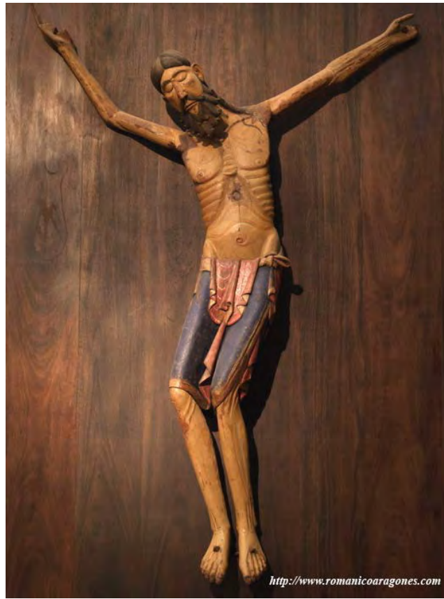
Fig. 9 – Crucifix from a Descent from the Cross of San Pedro de Siresa (Aragón), second half of the 12 th century, polychromed wood, 208 x 53 x 31 cm, San Pedro de Siresa Church, Fundación Santa María la Real/E. Hasta (permission for reproduction obtained by the autor 02/11/2018).