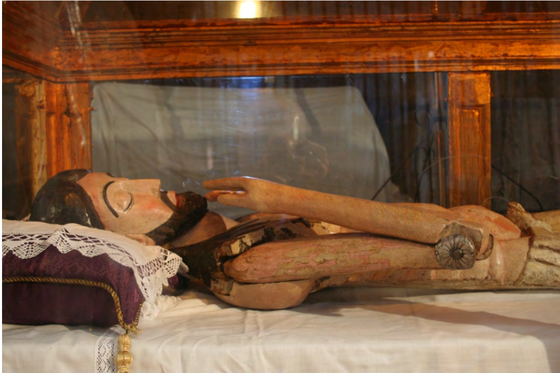
Fig. 15 – Cristo de los Gascones , 13 th century, polychromed wood, 182 x 70 cm, San Justo de Segovia Church (Castile) (Jordi Camps).

which, according to the literary and documentary sources, the ruler, often the king, played a large part 67 . On all these fronts, historiography has made substantial progress over the last two decades. I find myself obliged, however, to leave the broad and developed treatment of these subjects for future occasions.