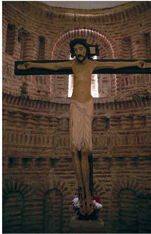
Fig 6 – Crucifix from Santervás de Campos (Castile), second half of the 12 th century, polychromed wood, 200 cm (Fundación Santa María la Real/P.L. Huerta) (permission for reproduction obtained by the autor 08/05/2019).

Gundisalvo of Oviedo (c. 1162-1174). The details of the cross or of Christ's crown, among other things, show that some of these images were decorated and treated in an attempt to reflect a certain splendour, as was seen more forcefully in works covered with precious metal, as I mentioned above. Beyond the possible association with works in other materials and formats, the image from Palencia has also been compared typologically to other crucifixes like those from Ourense Cathedral (Galicia), the Cristo de los Carboneros from San Cristóbal in Salamanca 34 , or, especially, the one from Santervás de Campos (Valladolid) 35 (fig. 6). Notwithstanding this, I believe that due to their appearance some of these works come from other workshops. But only a restoration and a detailed analysis of these carvings would make it possible to confirm my suspicions, the result of direct observation.