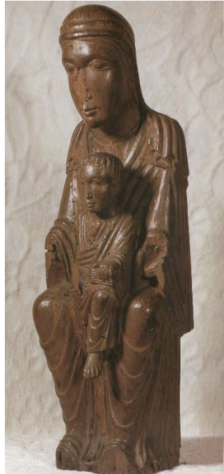
Fig. 4 – Virgin of Girona Cathedral (Catalonia), Girona, second third of the 12 th century, wood carving (formerly covered with silver), 44 x 15 x 12,5 cm, Capítol de la catedral de Girona, 10 (© Capítol de la catedral de Girona) (permission for reproduction obtained by the autor 02/05/2019).