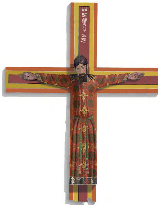
Fig. 14 – Majestat Batlló . Hypothetical reconstruction of the first layer of polychromy (Museu Nacional d'Art de Catalunya).