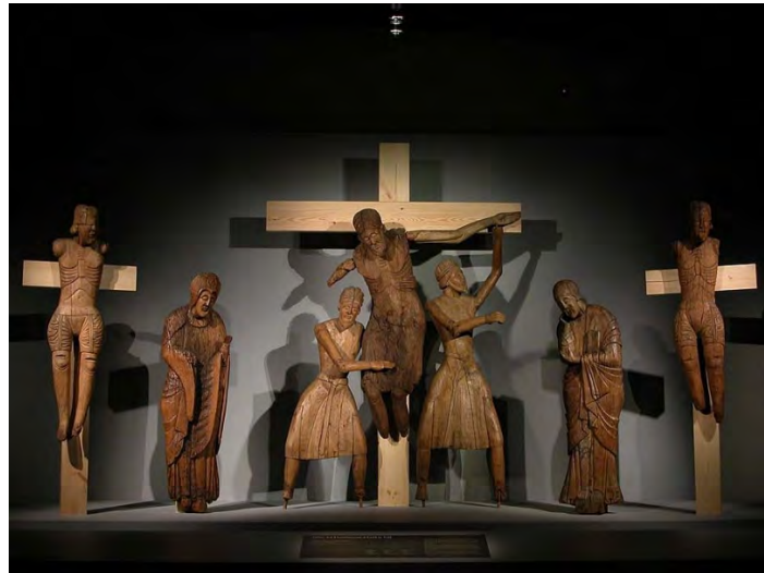
Fig. 8 – Descent from the Cross from Erill la Vall (Catalonia), second half of the 12 th century (?), wood with traces of polychromy, Dimas, 131 x 31 x 50 cm; Virgin Mary, 144 x 40 cm; Joseph of Arimathea, 134 x 68 x 27 cm; Christ, 147 x 126 x 41 cm; Nicodemus, 155 x 58 x 44 cm; Saint John, 144 x 40; Gestas, 136 x 33 x 59 cm, MEV 4229 (Dimes, Josep d'Arimatea, Crist, Nicodem, Gestes) i MNAC/MAC 3917 (Virgin Mary), 3918 (Saint John).

de Catalunya 40 , it is composed of seven figures, something that distinguishes the Catalan groups from all those known in Europe in the Romanesque period (fig. 8). It is unquestionably a group of notable quality, which excels in the abstract simplification of the physical features, the gestures and the clothes of the figures. But the work that most definitely stands out in this workshop is the famous Christ of Mijaran, an extraordinary torso that is the only vestige, with the hand of Joseph of Arimathea incorporated on its left-hand side 41 . As you will remember, conditions in the Aran valley are very different to those in the Ribagorça and Boí valleys. Geographically north-facing, in the Middle Ages it depended on the Occitan bishopric of Saint-Bertrand de Comminges. Despite its enormous power, it is feasible to think that in this region or further north in Languedoc there might have been other groups, now lost, acting as models or points of reference.