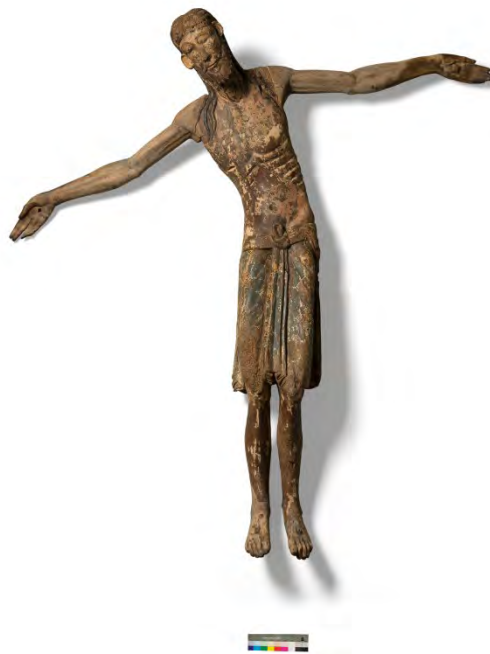
Fig. 2 – Crucifix from a Descent from the Cross (Asturias?), last quarter of the 12 th Century, polychromed wood, 180 x 165 x 42 cm, Museu Frederic Marès, Barcelona, MFMB 650,

door to future discoveries: thanks to a photograph taken in situ in 1917, it was possible to attribute a crucifix that had previously been of unknown provenance to Santa Maria de Cap d'Aran. More significant is the case of another Christ, in this case a Majesty, attributed for decades to a church near Ripoll; thanks to two photographs taken in the early twentieth century, we were able to certify that it came from the church of Sant Miquel de Prats, in Andorra 24 . To all this we may add yet another factor, the rigidity derived from the traditional division into artistic disciplines that has not always led to the creation and comparison of data obtained from the study of works similar to one another from the technical or material point of view. In this respect, the consideration of panel painted items of furniture ought to be especially useful, so significant in many ways with regard to the classification of objects carved in wood, as we shall see below.